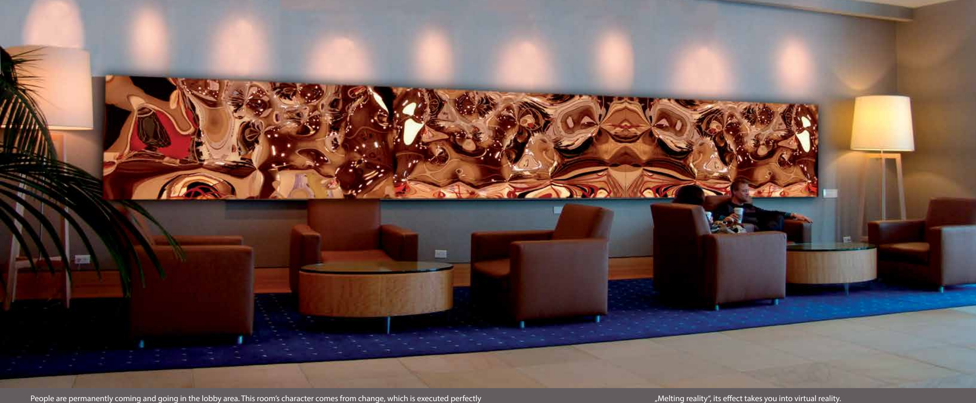
People are permanently coming and going in the lobby area. This room's character comes from change, which is executed perfectly in the "mirrored picture".