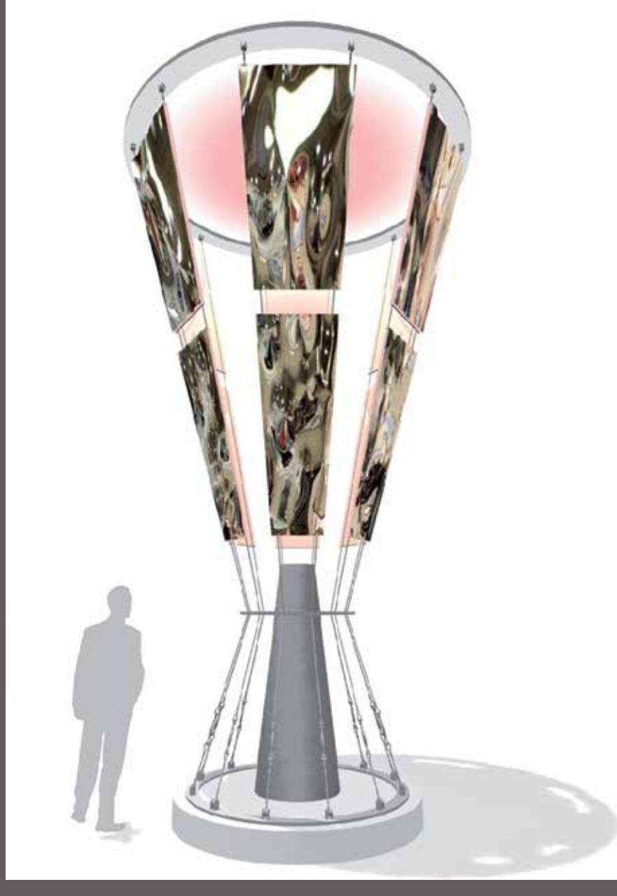
"All over" - The defragmented object appears to be a very gestural painting. Reality melts into a graphic all-over, in an artistic, perpetual motion, which is 2 dimensional